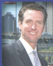
Lt. Gov. Gavin Newsom