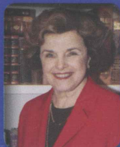
Senator Dianne Feinstein