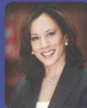
Attorney General Kamala Harris