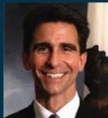
State Senator Mark Leno