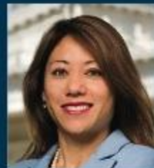
Assemblymember Fiona Ma